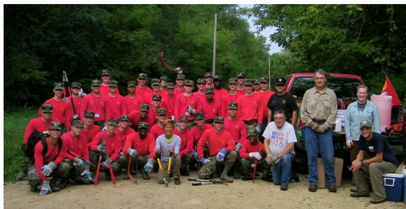
Cadets from the Challenge Academy and MVC staff and volunteers take a break during a work day in 2013.

Frise said the number of kids interested in the outdoors has increased. She estimated that she worked with about 1,000 kids last year. "They are looking forward to field trips and I think teachers and adult leaders are looking for more outdoor activities. We intend to provide them," she added.