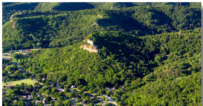
Cliffwood Bluff (center) received additional protection from a five-acre purchase.