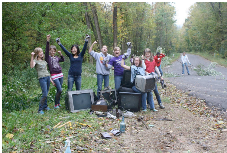
Lincoln Middle School students cheer their collection of trash during an MVC work day.