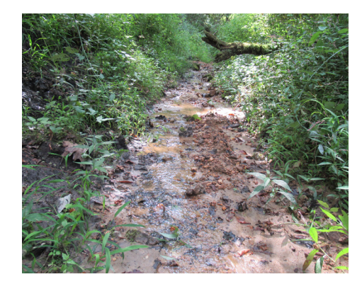
Water quailty is important to Ellen & Dave, who protect their springs and creek with perennial vegetation.