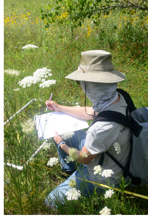
The MJV field technicians used a white PVC frame to survey plant species in small areas and then extrapolated findings to the larger area of study.

It is important to note that this site has not always been such inviting habitat for monarchs. In 2017, a pollinator prairie was planted by the City of La Crosse, with support from the U.S. Fish and Wildlife Service, Wisconsin DNR, Friends of the Blufflands, and Mississippi Valley Conservancy, with a mix of native prairie flowers and grasses, turning a barren quarry into a teeming oasis, providing much-needed habitat for monarchs, birds, and many other species. It is hoped that this prairie and others like it along with data collected by MJV, with funding from the National Fish & Wildlife Foundation, will help save the magnificent monarch. Thank you MJV for all your efforts! For more information about MJV and monarchs, visit www.monarchjointventure.org.