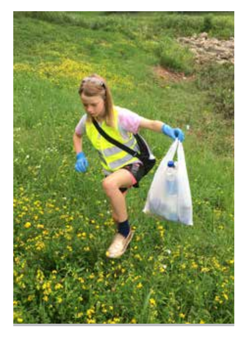
Naturehood Connections, our family-friendly volunteer program, makes stewardship activities accessible and rewarding for everyone.

Brainstorm about solutions. We look forward to building partnerships that can help focus and amplify our collective efforts to inspire climate action. We'd love to hear your ideas.