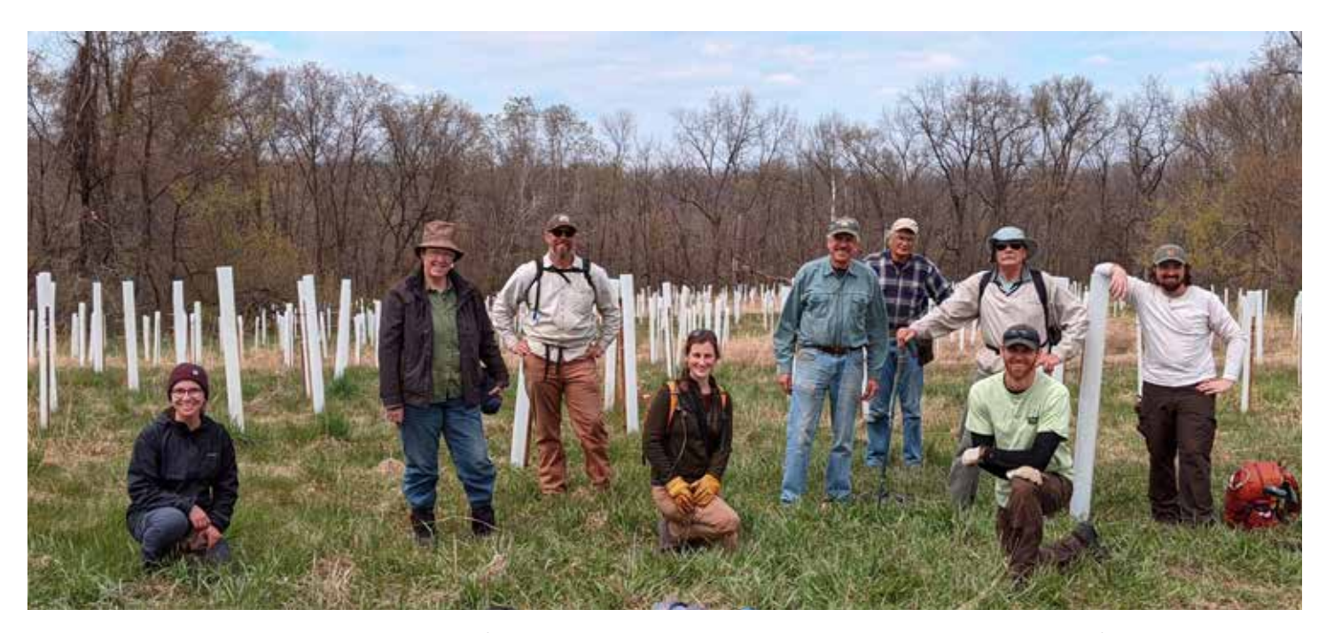
Two-thousand oak trees were planted by staff, volunteers, interns, and board members at the Cassville Bluffs nature preserve in Grant County in early 2021. The trees will provine additional habitat for migrating birds as they sequester and store carbon above and below the ground.