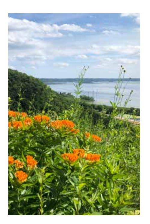
Member support and special project grants make it possible for Conservancy staff, interns, and volunteers to restore wildlife habitats for resilience to climate change. As a result, this prairie at Sugar Creek Bluff, a State Natural Area, provides the pollen, nectars, and nesting areas on which an entire community of wildlife depends.

Connecting to local communities. Whether it's conserving locally important lands, or partnering with community organizations, we know that addressing climate change means ensuring that everyone can experience the climate benefits of land and water.