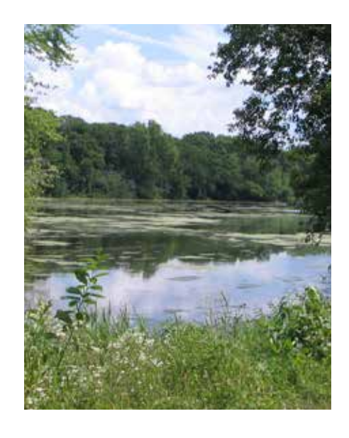
The protected wetlands at Trempealeau Lakes nature preserve are part of a natural complex of backwaters that help prevent flooding in the Mississippi River Valley.

The impact of land and water NCS depends on the timely transition from fossil fuel to compatible renewables, including energy conservation. That's why this climate action plan takes an integrated approach to help communities throughout the Driftless Area.