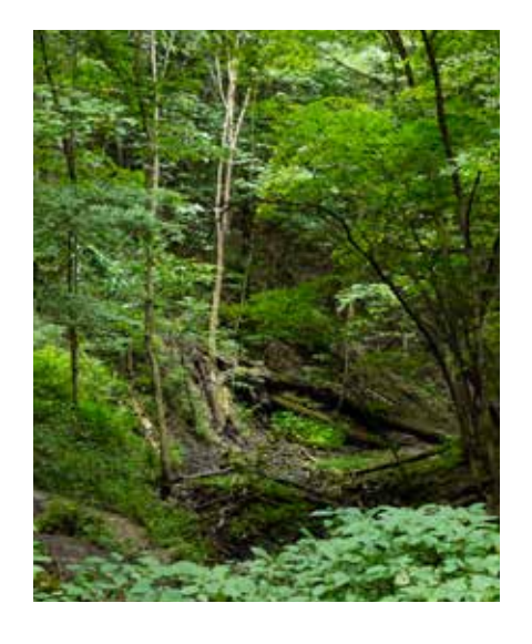
Protected lands in Wisconsin's Driftless Area provide the food and shelter that many wildlife species have evolved to depend upon over thousands of years. We depend upon them, too, for the ways in which they protect water, health, beautiful landscapes, and our local economy.

Now, more than ever, we need everyone to join us as we address one of the greatest challenges we have faced while conserving land and water for generations to come. We know it will take an integrated approach. We must transition away from using fossil fuels and simultaneously work to tap the power of natural climate solutions. With your help we can address climate change in a meaningful way.