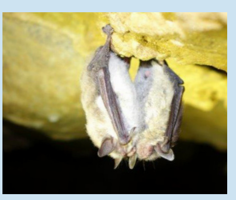
2017 photo of little brown bats at Kickapoo Caverns

2021 restoration work at the property will include a new roof and other improvements to the cave entrance building plus improved access for the bats. Already old and weathered, the building was damaged by a tree fall last year. Restoring it will allow us to proceed with plans to use it as a simple interpretive center. Due to the construction, there will be no cave tours this year.