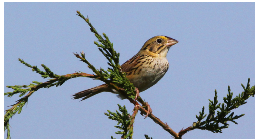
The Henslow's sparrow (above) is listed as a federal species of concern and a threatened species in Wisconsin.