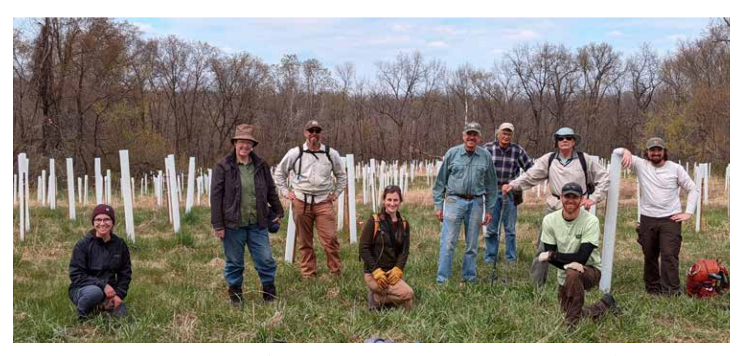
Two-thousand oak treeswere planted by staff, volunteers, interns, and board members at the Cassville Bluffs nature preserve in Grant County in early 2021. The trees will provine additional habitat for migrating birds as they sequester and store carbon above and below the ground.